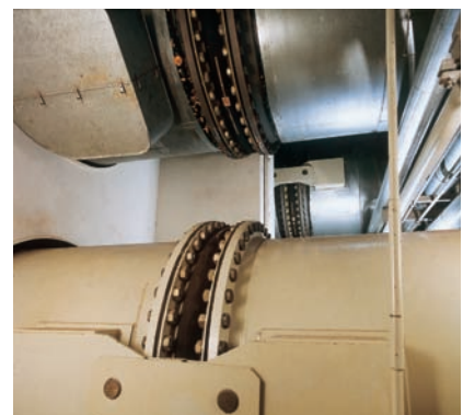
STENFLEX® type C-1 with special high restraints in cooling water system of a power plant

Subject to technical alterations and deviations resulting from the manufacturing process.