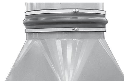
STENFLEX® type D-30 with tightening straps in an air duct

Admissible operating pressure, effective cross sectional area, reaction forces, moving forces and spring rates depend on expansion joint's size. Please inquire.