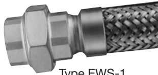
Type EWS-1 with female thread