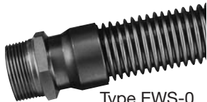
Type EWS-0 with male thread