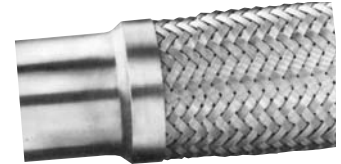
Type EWS-2 with welding end